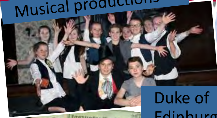
Duke of Edinburgh Award