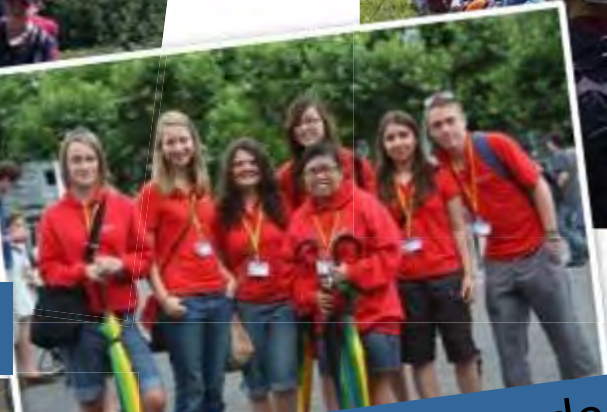
Pilgrimage to Lourdes