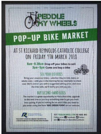
Pop-up Bike Market