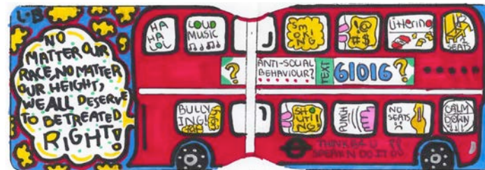
Design travel card wallet