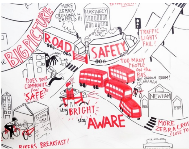
Design poster campaign