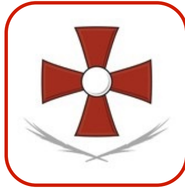
SRCC Active Travel App