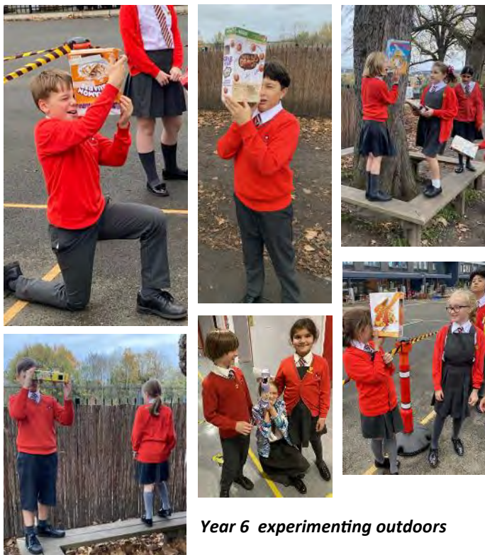
Year 6 experimenting outdoors