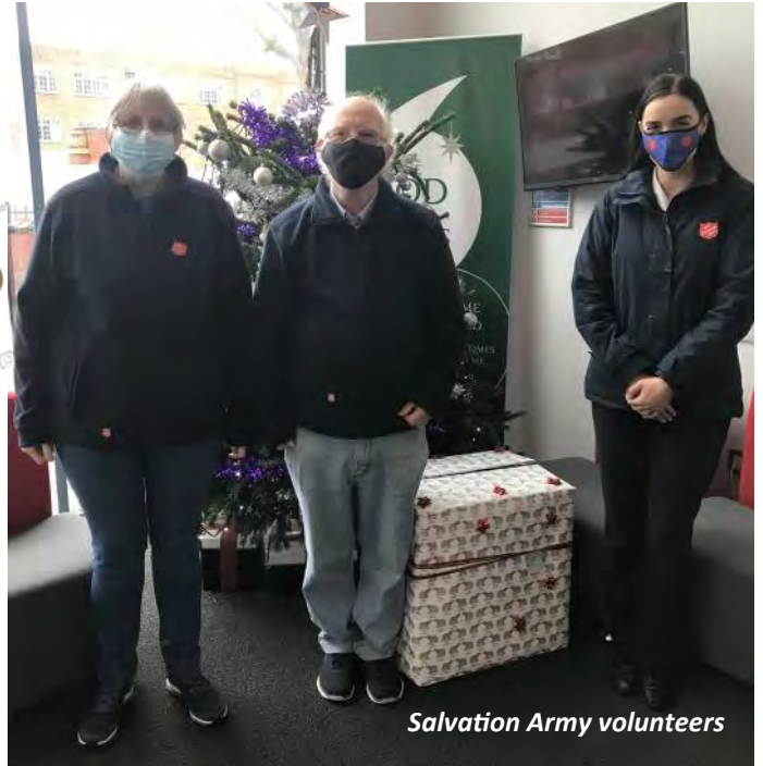
Salvation Army volunteers