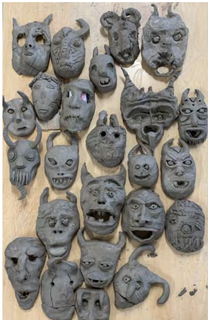
Year 8 Clay Masks Responses