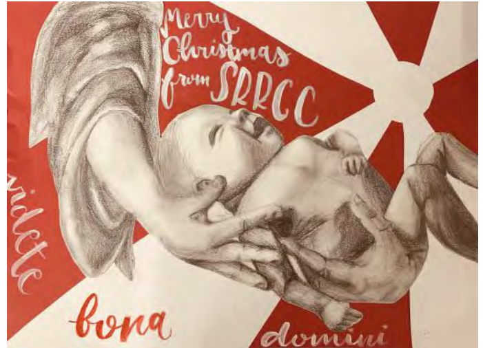
Beatrice Battaglia (Yr 8)