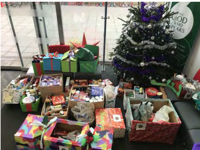
Congratulations to 10P who picked up first prize for their clever box design

They also supplied crates and bags full of food for the Christmas Beaver Box Campaign going to local families in Hampton and Richmond.