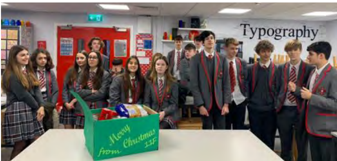
Year 11 with their Salvation Army boxes