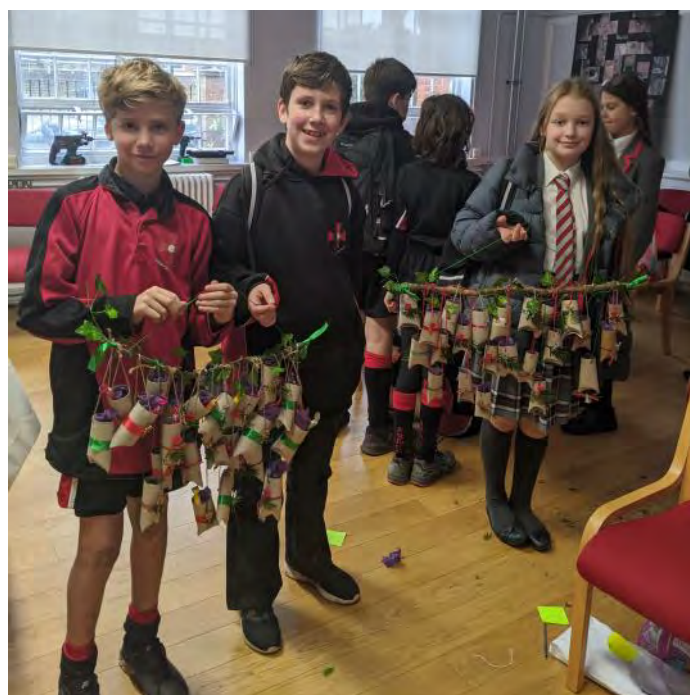
Primary and High School represented Remembrance Day by creating these fabulous displays in the Chapel and School.