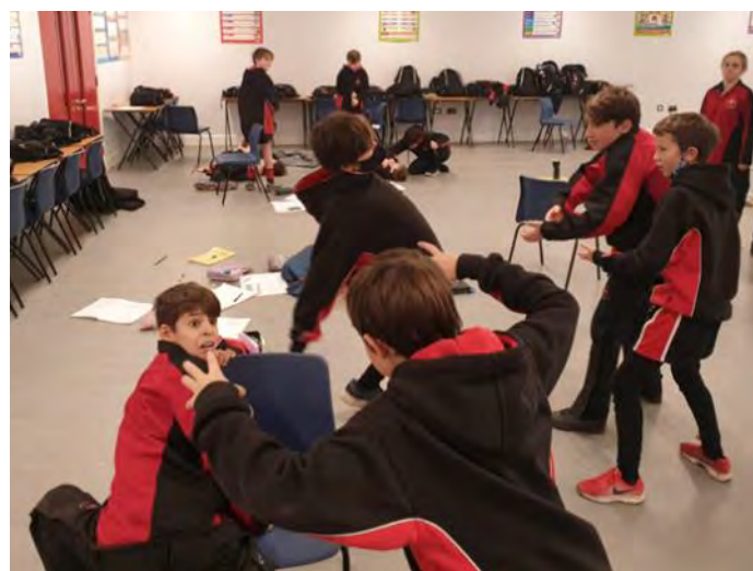
Year 7 drama- acting out Darkwood Manor