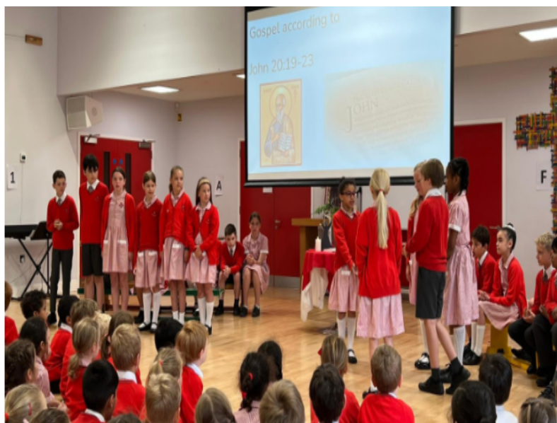
Year 5 Pentecost Liturgy